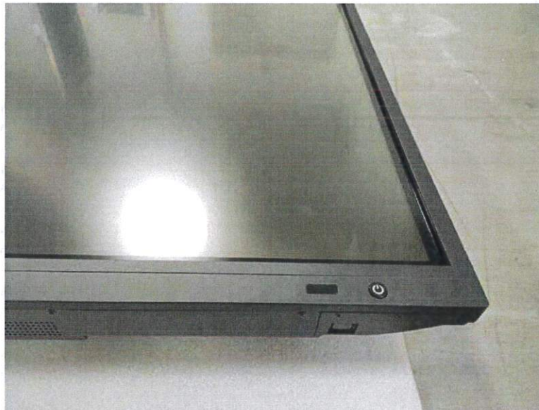
EUT photo 4